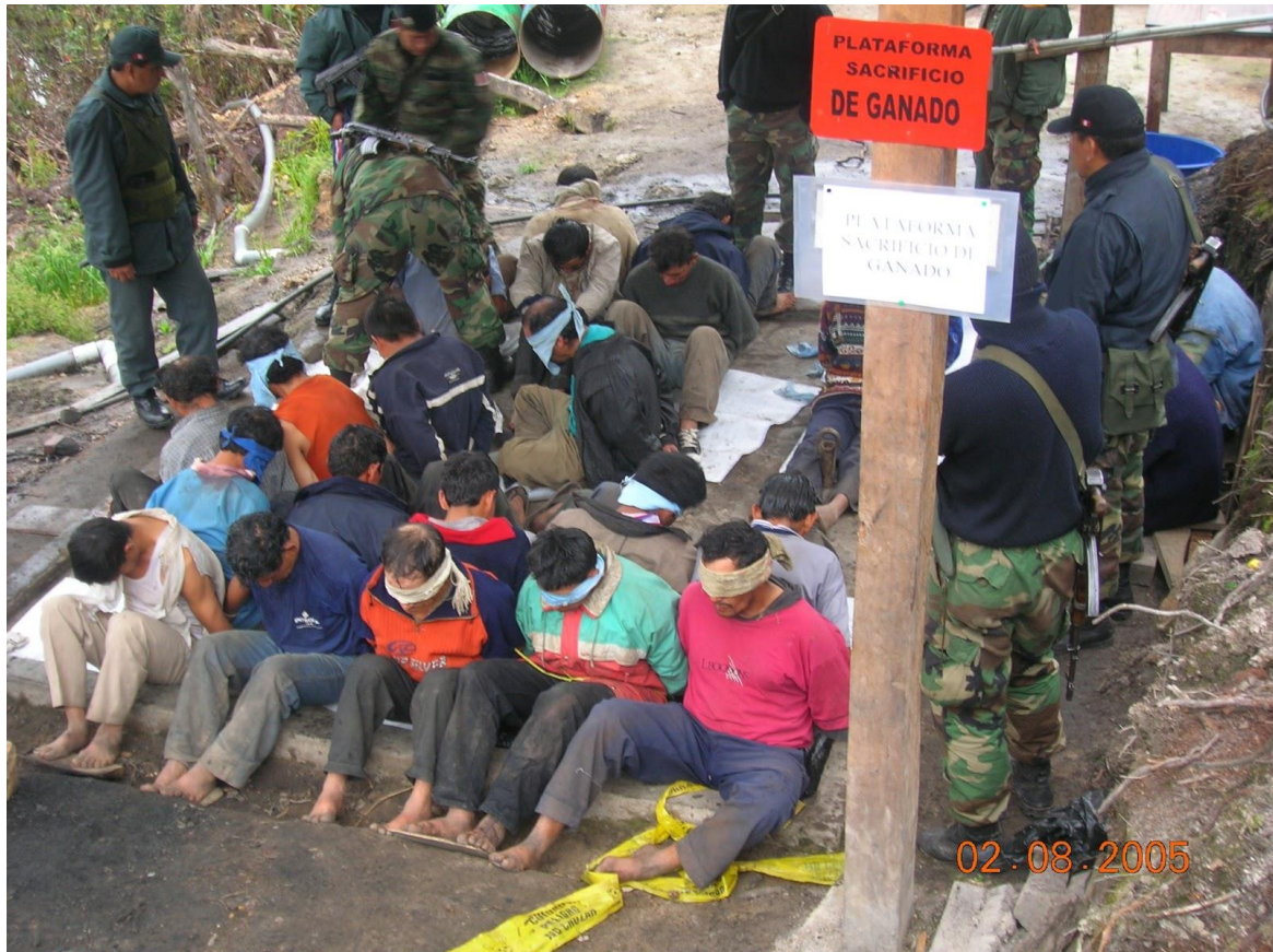
Photo 2: Detained and tortured protesters at the mine Majaz in Plura in 2005

2013 the Defensoría reported 175 active disputes, 107 linked to mineral resources and 19 to fossil fuels. 12 In only around half of these disputes had the government instigated a process of dialogue. 13