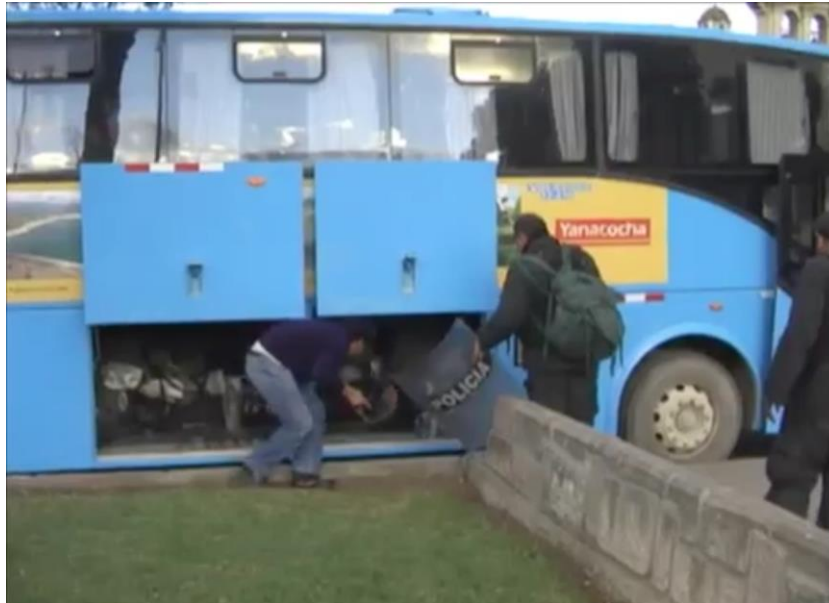
Photo 2: Yanacocha bus used to transport police officers