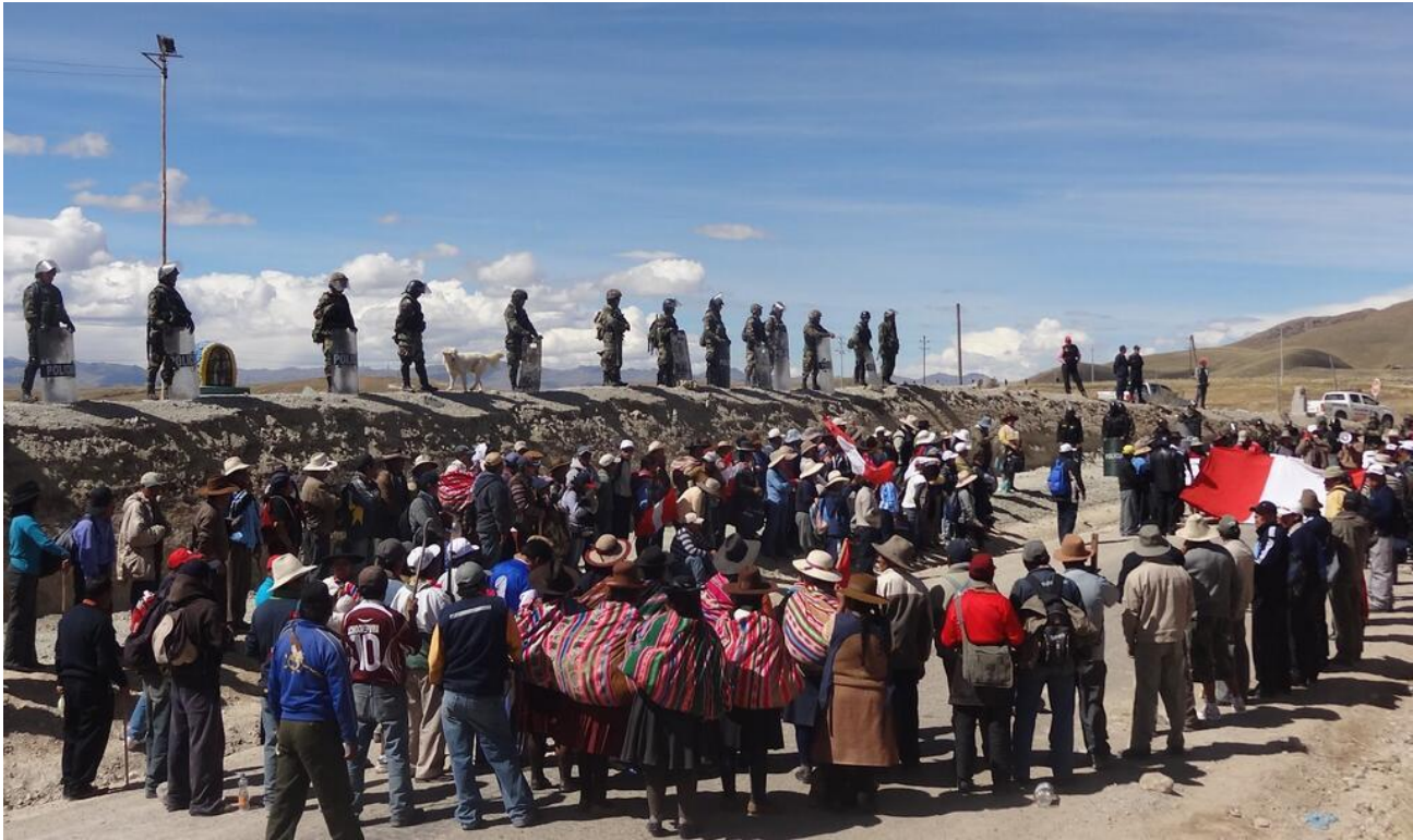
Photo 3: Protests against Xstrata Tintaya mine on 24 Mai 2012 in Espinar, Cusco.

cohesion and the creation of divisions within the community. 51