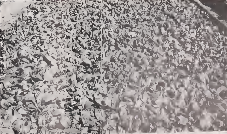
Result of sowing tobacco plant bed at the proper time and protecting it against blue mold and frost damage—about 30,000 large, vigorous plants to 100 square yards of bed. Photographed April 2, 1943, at the Coastal Plain Experiment Station, Tifton, Ga.

areas. The plants, however, are easily killed by frosts, and it is a far safer plan to sow the seed at the time recommended for the locality.