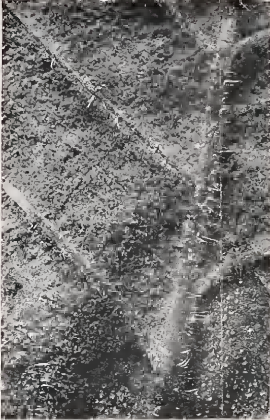
AWI-77 Issued November 1943 U. S. DEPARTMENT of AGRICULTURE

C ONTROLLING plant diseases prevents losses in crops and money and also conserves the manpower, time, and effort otherwise wasted when diseased crops fail to bring returns. Blue mold (see cover illustration) is an outstanding disease problem throughout the flue-cured tobacco area. It attacks the plants in the seedbed and may weaken them and delay transplanting, or kill the plants outright.