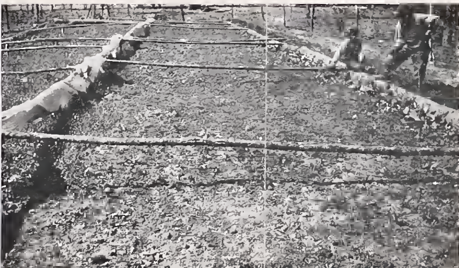
Result of early sowing and failure to protect tobacco bed against blue mold or frost—about 1,800 small, weak plants to 100 square yards of bed. Photographed April 3, 1943, in Georgia.