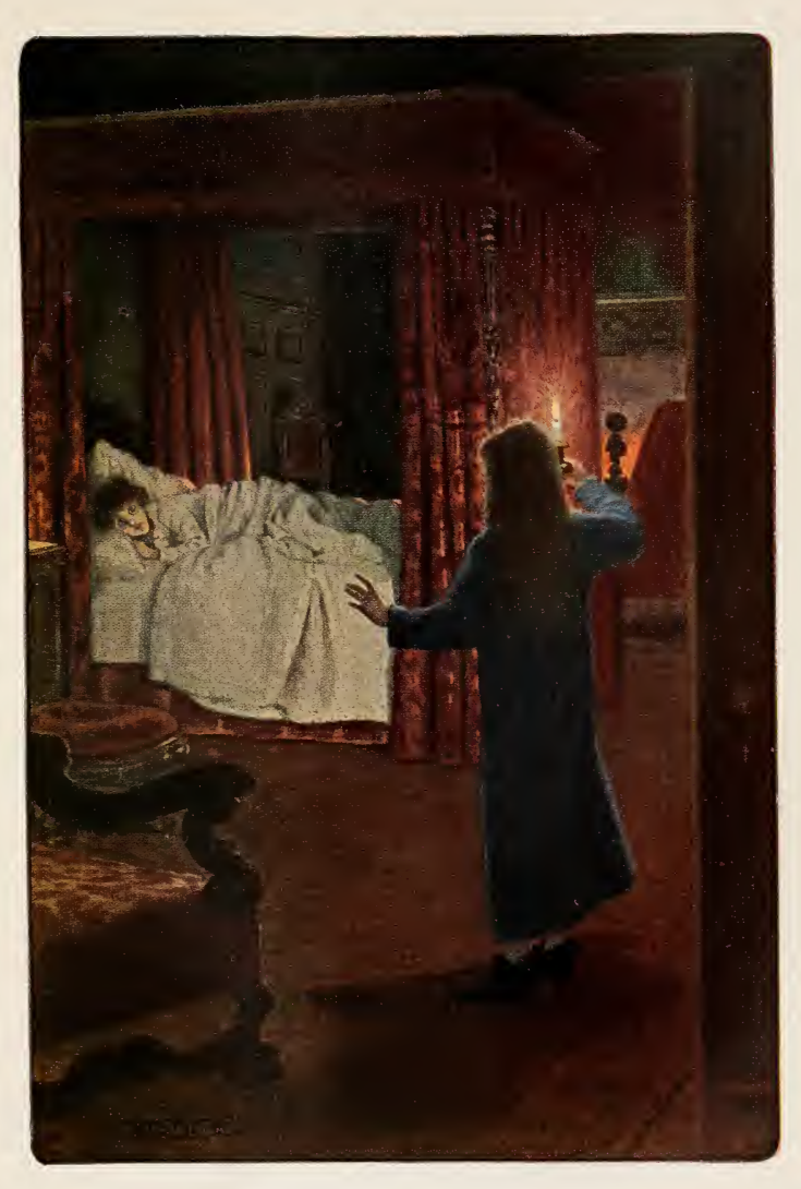
"'WHO ARE YOU?-ARE YOU A GHOST?' "-Page 157