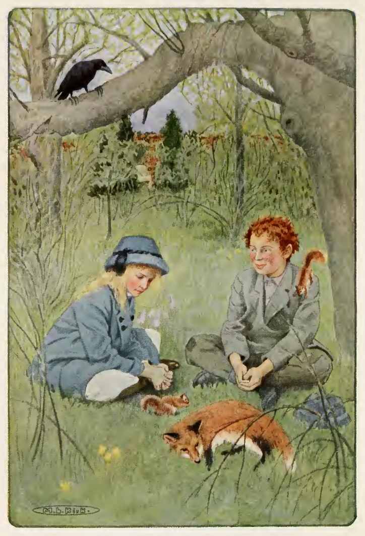
"IT SEEMED SCARCELY BEARABLE TO LEAVE SUCH DELIGHTFULNESS"-Page 231