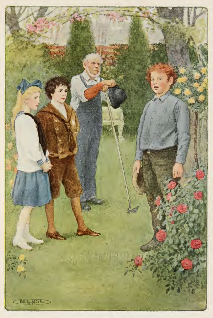
"'PRAISE GOD FROM WHOM ALL BLESSINGS FLOW" "-Page 344